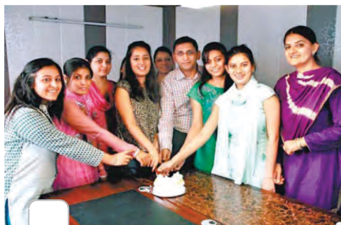
जेआरएफ और नेट की परीक्षा पास करने पर मंगलवार को केक काटकर खुशी मनाते स्टूडेंट। अमर उजाला

जून में 77 जेआरएफ और 531 ने नेट (कुल 608) क्लीयर किया। पीयू सेंटर से सबसे अधिक एजुकेशन संकाय में 67 स्टूडेंट ने नेट और 5 ने जेआरएफ क्लीयर किया है। इकोनॉमिक्स में 8 (2 जेआरएफ) और सोशलॉजी में सिर्फ 7 (2 जेआरएफ) स्टूडेंट ही नेट क्लीयर कर सके। देश भर में यूजीसी का पास प्रतिशत 4.1 फीसदी जबकि चंडीगढ़ सेंटर का 3.24 फीसदी रहा है।