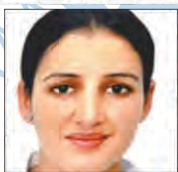
किरण (नेट गांधीयन स्टडीज)